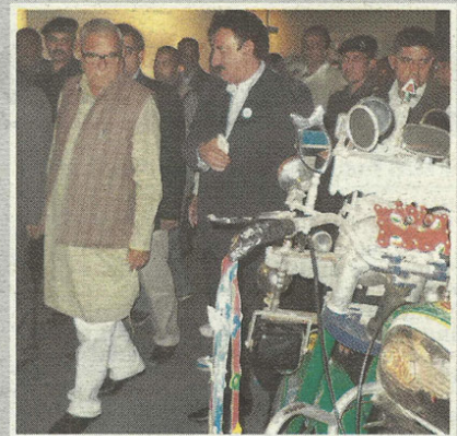
A 1946 Mercury Sedan and an antique train compartment (top right) are on display at the museum, inaugurated by Haryana CM B.S. Hooda (right) on Saturday.